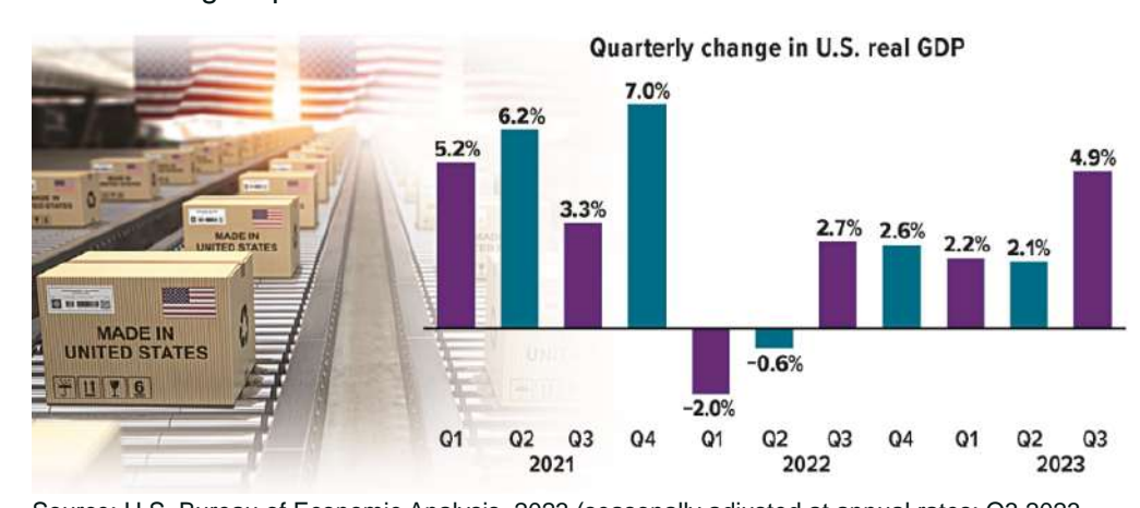
Source: U.S. Bureau of Economic Analysis, 2023 (seasonally adjusted at annual rates; Q3 2023 based on advance estimate)

Current-dollar (nominal) GDP measures the total market value of goods and services produced in the United States at current prices. By adjusting for inflation, real GDP provides a more accurate comparison over time, making its rate of change a preferred indicator of the nation's economic health.